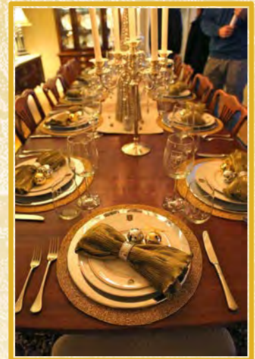
Stops along the 2014 Tour of Homes (above)